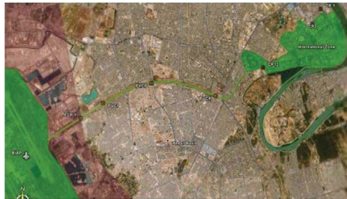
PVCP = Permanent Vehicle Checkpoint CP12 = Checkpoint 12 (the main access/egress point into the IZ from West Baghdad (Joint US and Iraqi Army).

Pick up and transfer to accommodation – Olive Group will meet you at BIAP and transfer you and your luggage directly to the accommodation. Your move to the International Zone will take approximately 15 minutes. It will be in a high profile Olive Group Private Security Detail